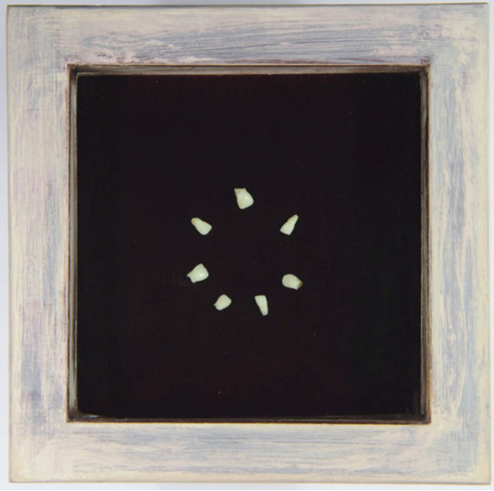
Figures 7.3 and 7.4. The spicy mouth and the relic box. Details of D2I, 30 cm x 21cm and 17.5 \text{cm} \times 17.5 \text{cm} .