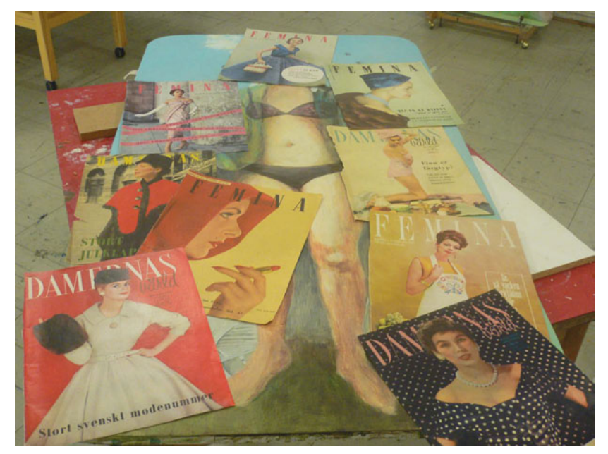
Figure 4.1. A painting covered with magazines. Honest Fortune Teller installation progress, January 2005.

what was going on with the singularity and unpredictability of process she was dealing with. Maybe, then, we should do what Deleuze (2003, 99) suggests: listen more closely to what painters have to say. Maybe, when we listen closely enough, attentively following the ebbs and flows, the vocabulary of process will start to build itself up.