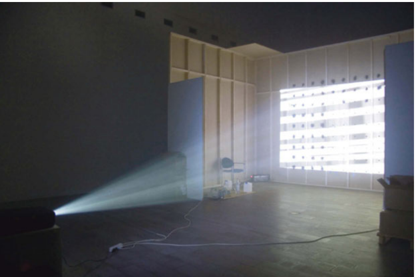
Figures 1.2 and 1.3. Heaven Machine and its technical machine. For videos of Heaven Machine go to http://www.jaakkoniemela.com/ > Heavenmachine 2005 > videos 1-2.

by way of its working, brings something new into this world? How would that change the relation between an artwork and the subject experiencing it? In the writings of Deleuze and