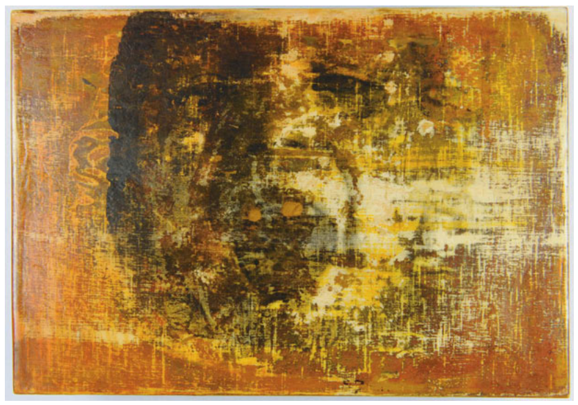
Figures 7.1 and 7.2. The grimacing mouth and the reddish, bloodish brown mouth. Details of Susana Nevado's D2I, 2002, mixed media, 30 x 21 cm.