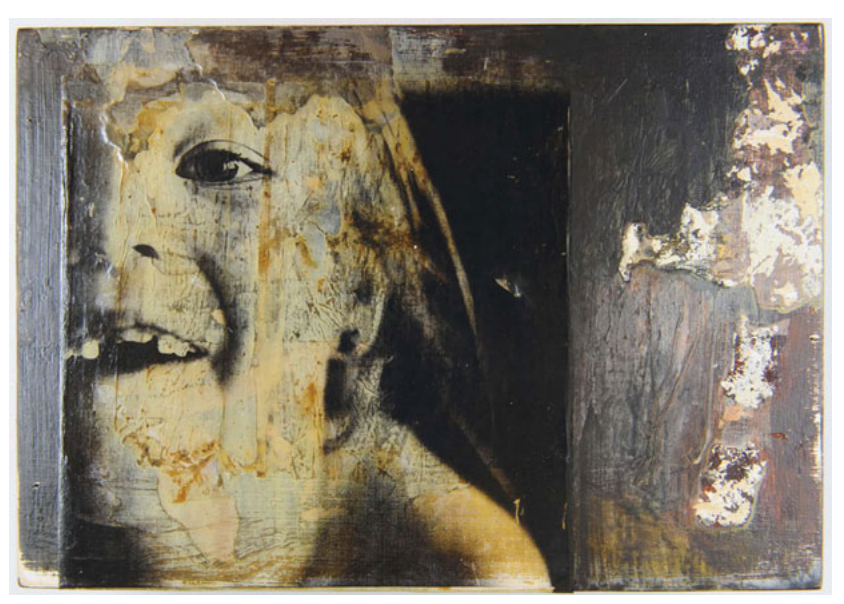
Figures 7.7 and 7.8. A joyful monster. Details of D2I .