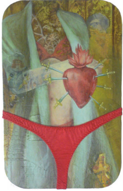
Figures 4.2 and 4.3. Painterly contrast: a painting with and without panties. Details of Honest Fortune Teller , 67cm x 38cm, Spring 2005.