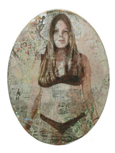
Figures 2.3, 2.4 and 2.5. Paintings with multiple navels (not in scale). Details of Honest Fortune Teller , mixed media, 30 x 21 cm, 130 x 70 cm and 150 x 81 cm, Spring 2005.