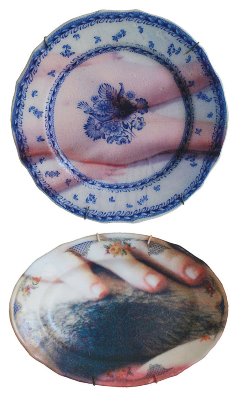
Figure 6.1 and 6.2. Assemblages of art and life. Details of Invisible Spirit [Espíritu Invisible], Spring 2004.