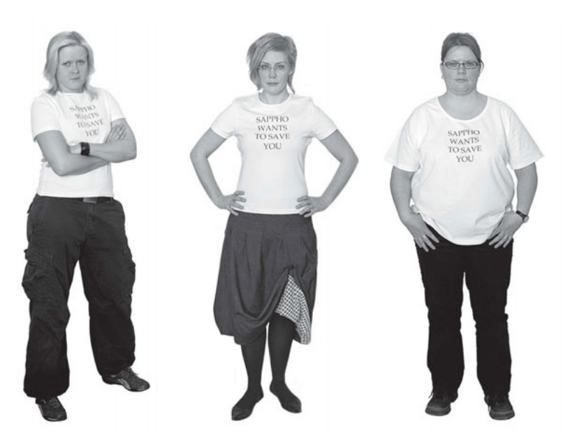
Figures 8.3 and 8.4. Sappho Wants to Save You installation at Zigzagging from Art to Theory – and Back exhibition, curated by Katve-Kaisa Kontturi. Titanik Gallery, Turku, November 2010; and portraits for Sappho Wants to Save You, July 2006.