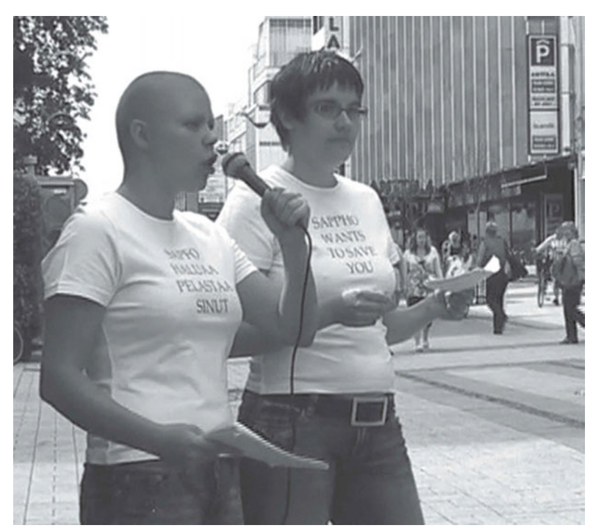
Figure 8.1. The preachers. Frame enlargement of Marjukka Irni's Sappho Wants to Save You video, 2006.

a vibrational sound. Brian Massumi and Erin Manning (2014) designate settings where bodies are in a dynamic relation to each other, 'events'. Affects are relations that make an event emerge, they hold it together, relationally. Affects are qualitative changes, felt as intensities in, or rather in between bodies. Events are always singular - they happen between specific bodies and their relations. Alter or adjust one element, and the event becomes different. Yet it is possible, as Massumi (2015, 109) claims, to experience collective events, where bodies, each in their unique way, relate to, perceive and process the same 'cue' such a singular preaching voice. No preacher without a body, no preacher without surrounding bodies. No event without change. No event without becoming.