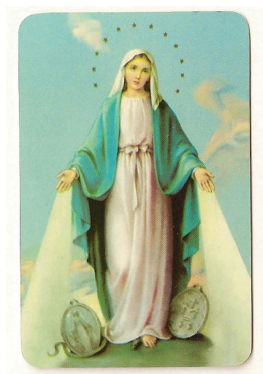
Figure 2.2. The original holy card of María Madre de Misericordia.