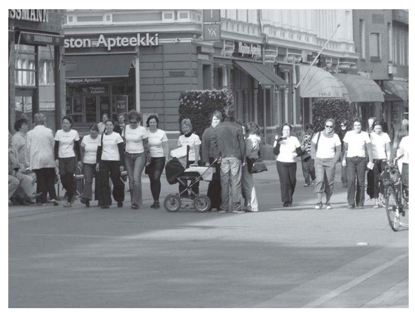
Figure 8.2. The demonstration march in Turku, Sappho Wants to Save You (Lesbian Missionary) community art project with the Gender Studies departments at the University of Turku and Åbo Akademi University, May 2006.