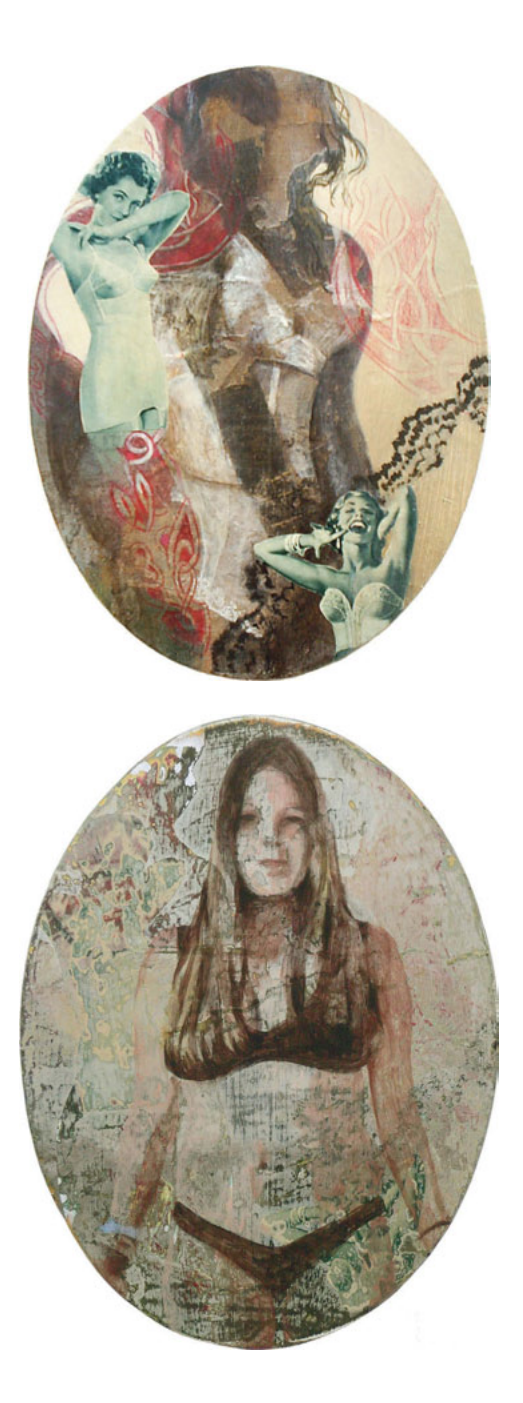
Figures 2.6 and 2.7. The double navel painting and its earlier phase. Details of Susana Nevado's Honest Fortune Teller , mixed media, 30cm x 21cm, Spring 2005.