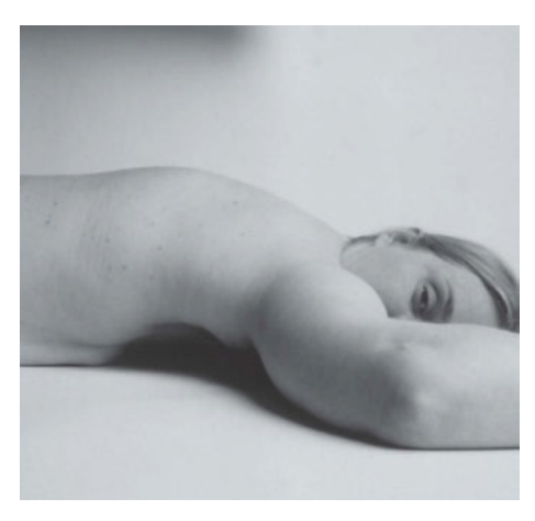
Figures 9.3, 9.4 and 9.5. Healing hands and eyes, the horizontal connection. Helena Hietanen, Sketches, 1999 –.