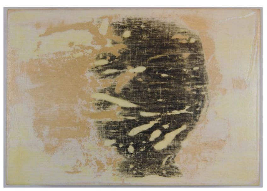
Figures 7.5 and 7.6. The joyful smile and the sandpapered smile. Details of D2I .