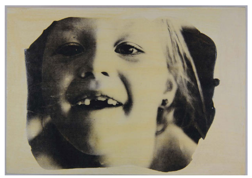
Figures 7.9 and 7.10. The portrait with the recipe and the little girl sustaining change. Details of D2I .