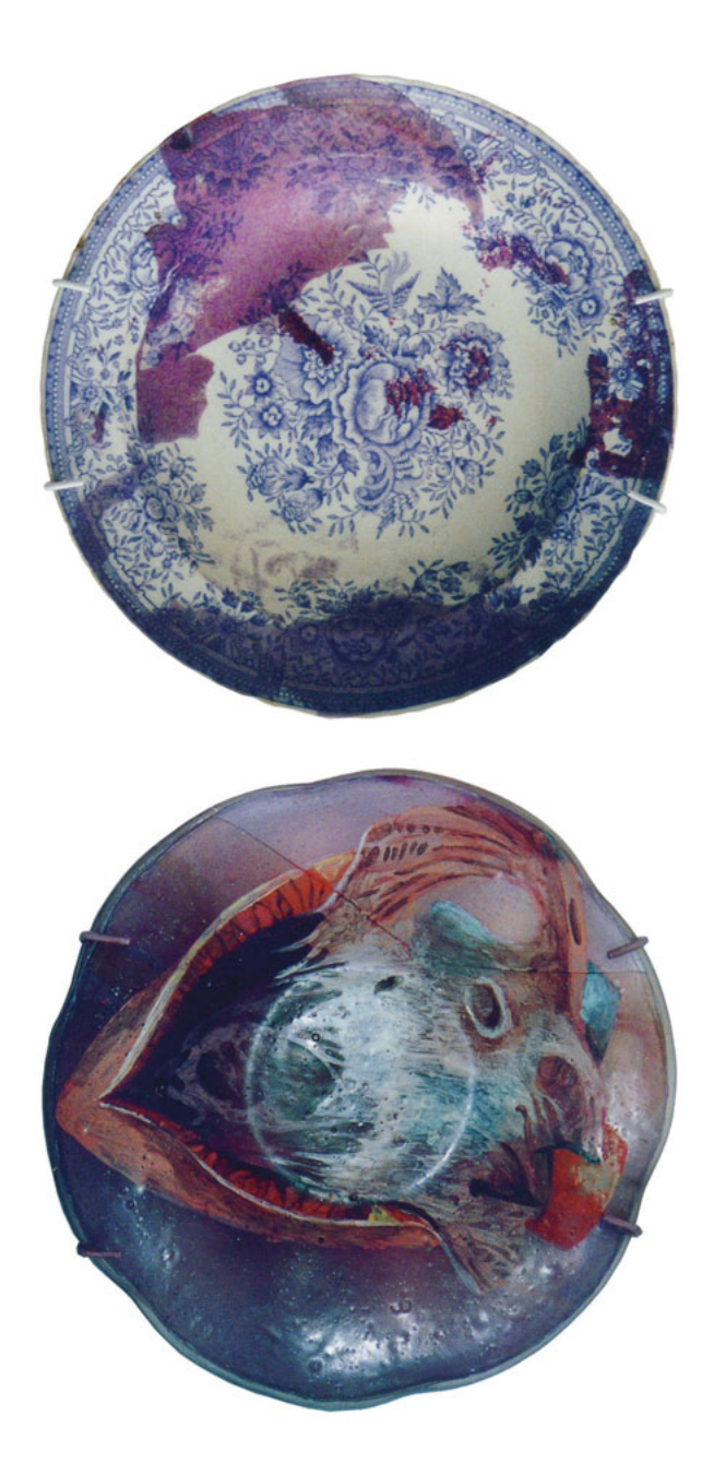
Figures 5.2 and 5.3. Un-recognition I: Layered plates. Details of Susana Nevado's Invisible Spirit [Espíritu Invisible], mixed media on second hand plates, size variable, process documentation of On the Other Side exhibition at the Gallery of the International Cultural Centre Caisa, Helsinki, April 2004.