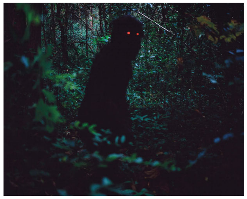
Fig. 1: The close-up of the monkey-ghost looking straight at us with his red eyes, from Uncle Boonmee Who Can Recall His Past Lives .