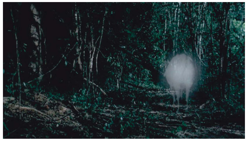
Fig. 30: Still from Uncle Boonmee.

away in the name of legibility the vague and distinct-obscure that persists in all of our aesthetic experiences? How to account for that unknown element in them which interpellates and draws us in, often without our knowing why? Perhaps it has to do with their allure , the more or less virtual movement that adorns certain things or people with an unprecedented propositional power. For the word "allure" points toward the singular manner that courses through a being and characterizes it: a sort of evanescent signature – a style – charged with a force of affective propulsion that invites further folds and relays. But conversely, the word also reveals an interplay of capture and enthrallment, how the captivating allure acts as a lure for feeling. This idea of a propositional efficacy that stands in direct relation to the sensible is at the heart of Whitehead's philosophy. It concerns the way in which a proposition, aesthetic or otherwise, acts as an attractor for new feelings and as a vector for new becomings. Indeed, for Whitehead, any propositional feeling is an occasion for the modification of experience, for a bifurcation that could potentially create an event or be taken up again later. As Isabelle Stengers writes in her monumental Thinking with Whitehead, "the entertainment [of propositions] lures us into feeling, thinking, speaking, in short, becomes, in the most various ways, an