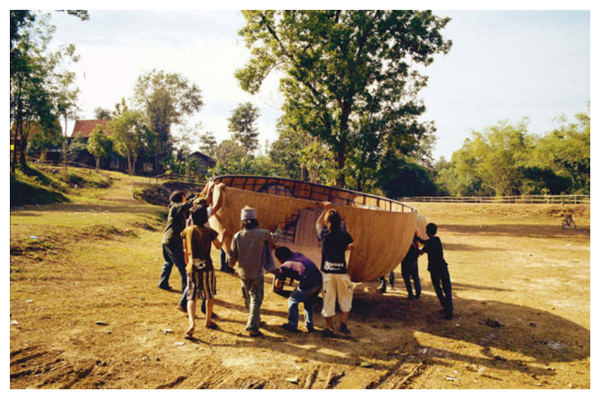
Fig. 31: Construction of the spaceship.

the invisible gathers in secret; spectres come and go, without tragedy or terror. They participate in a "subtle fantastic, one that has no regard for supernatural manifestations and turns the real, the ordinary, the everyday into an apparition, an epiphany, a ghost, indeed, into a shrouded cadaver" (Leutrat 199: 101). If Apichatpong assigns such a determining role to the night – the time of metamorphoses and transformations par excellence – he also takes great care to remind us that ghosts only appear under conditions of liminality, specifically "at the break of dawn and twilight" (Weerasethakul 2009: 192). Apichatpong's films are recognizable for being both initiatory and fundamentally a-dramatic, for the modest way in which they make night fall into the day in order to activate the minimal, liminal and potentially magical threshold of cinema.