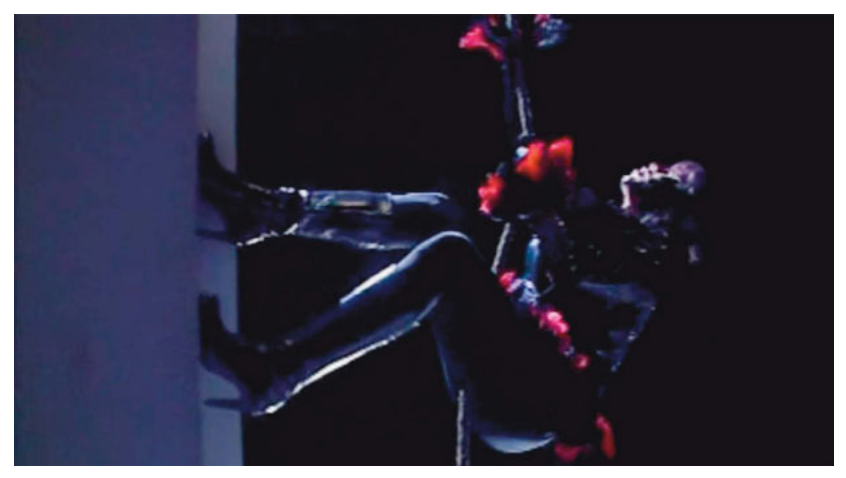
Fig. 7: Still from The Adventure of Iron Pussy .

work and stealthily gather information over her shoulder (Fig. 6); we see her climbing up the wall of a house and immediately know that the scene was shot horizontally on a fake wall (Fig. 7). These shots are all the more delightful because the story doesn't make any sense. Pussy has a number of impossible costume changes (from one shot to the next within the same scene). On a hunting excursion in the jungle, she saves her love interest Tang from a Tiger (!), then confronts him at gunpoint