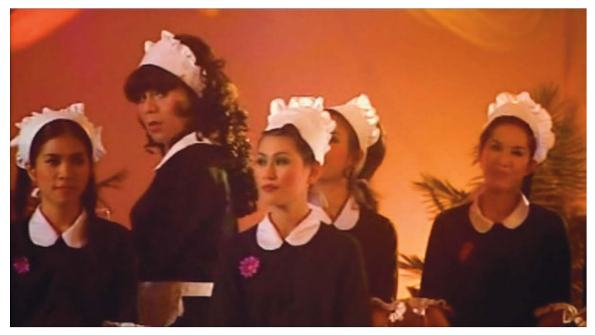
Fig. 6: Still from The Adventure of Iron Pussy.