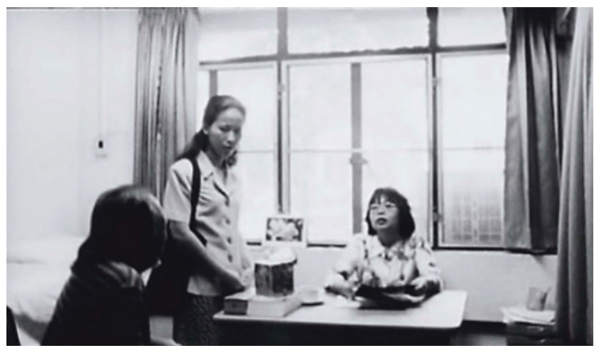
Fig. 4: Still from Mysterious Object at Noon, 16 mm (blown up to 35 mm).