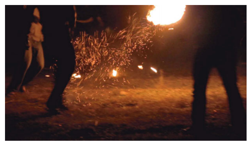
Fig. 34: Still from Phantoms of Nabua.

possess the remarkable power to transform into seers those who are disposed to be interpellated by its transparent mystery, to make them more attentive to the thin spiritual veneer that laces their gestures and to the share of the unlived that persists in them; in short, to make them, in as gentle a way as possible, contemporaries. "And to be contemporary means in this sense to return to a present where we have never been" (Agamben 2009a: 51–2). But is this even possible?