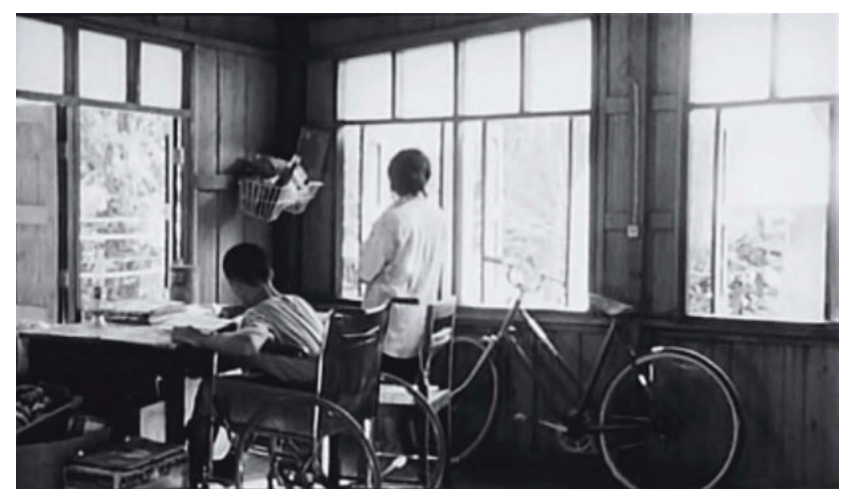
Fig. 2: Still from Mysterious Object at Noon, 16 mm (blown up to 35 mm).

The first shot of the film is from inside a vehicle, a vending truck selling seafood, that makes its way through busy city streets. For minutes, we roam through the urban landscape; a radio soap opera offers a wistful tune on the radio soon accompanied by the voice of a narrator relating a story of love and loss. The vendors have a purpose but no particular destination, roving the neighborhoods to sell their goods at this street corner or another. Open drift and dreamy song set the tone for the next hour and a half or so. We'll never lose this momentum as the camera moves from one storyteller to the next, even as it stands still to record bits of story. As the truck comes to one of its many halts, we meet one of the vendors who becomes the first narrator in the film. She relates her own story: sold by her parents for two bus tickets back to their village home, she now ekes out an existence on the streets of Bangkok. She has barely finished her story when the "editor" behind the camera asks: "Now, do you have any other stories to tell us? It can be real or fiction. [...] Any story ... from a book or something." Tell us any story besides yours. Or rather: now that we have heard your story, tell us something else, something more that isn't you. You + n. This is how Mysterious Object at Noon passes through